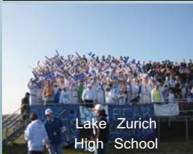
Lake Zurich High School