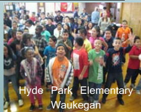
Hyde Park Elementary - Waukegan